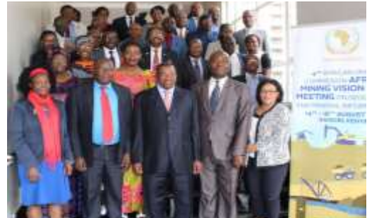
Group Picture: 4th African Union Commission Africa Mining Vision TWG meeting on Geological and Mineral Info.14 - 18 Aug 2017 in NBO, KENYA.

The objective of the meeting was to review progress made in the implementation of the continental Geological information and Geoscience programmes and initiatives such as PanAfGeo, Africa Minerals Geoscience initiatives (AMGI) as well as finalize the Geological Mineral Information System (GMIS) Strategy for submission to the Specialized Technical Committee, which is scheduled to take place in October/November 2017.