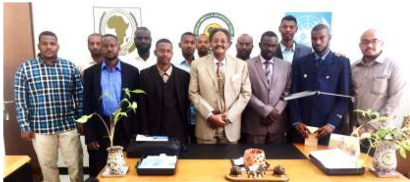
AMGC Director General with the Sudanese Mining Engineers from SMRC, Sudan.

The Mission of AMGC is "To promote socio-economic and environmentally responsible mineral development in Africa"